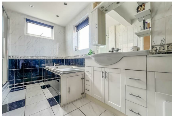
First Floor & Landing:

16'11" x max x 9'0" narrowing to 6'4" (5.18m x max x 2.75m narrowing to 1.94m)