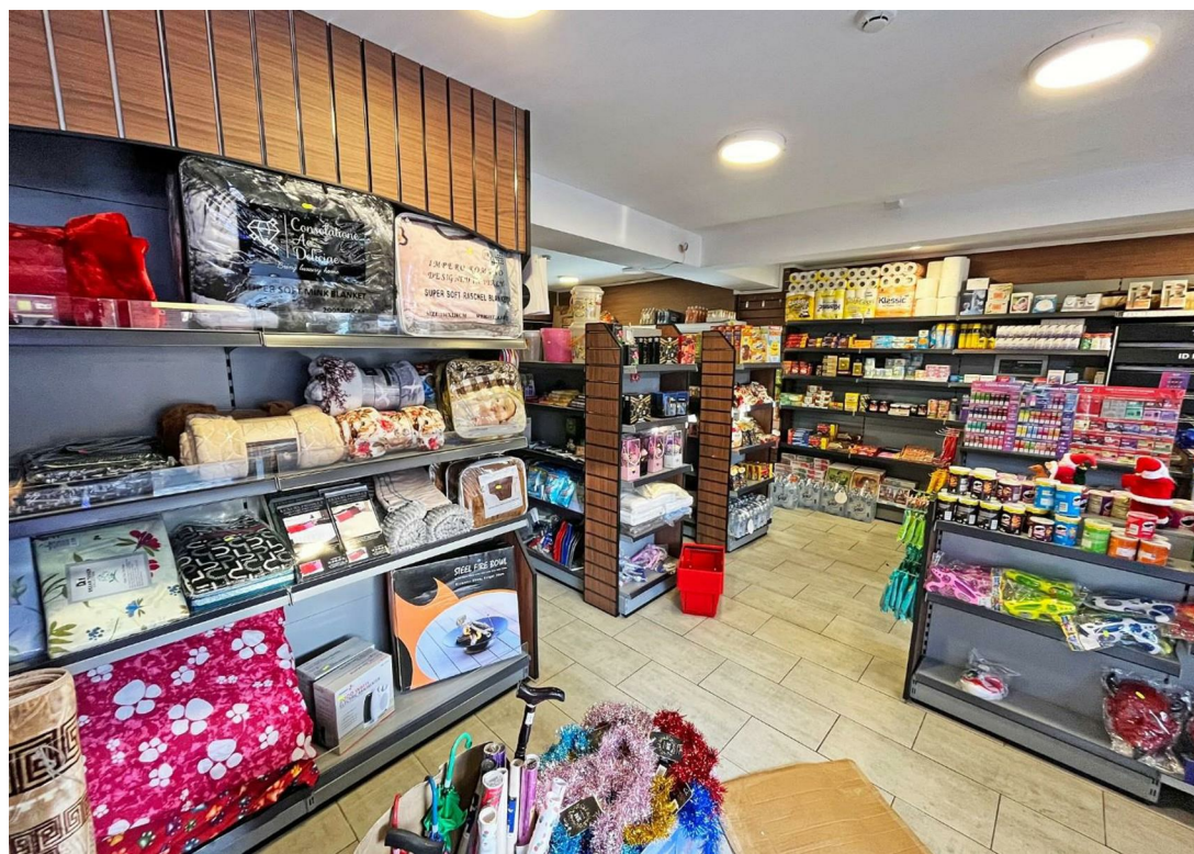
46 & 46b Market Street Whittlesey PE7 1BD