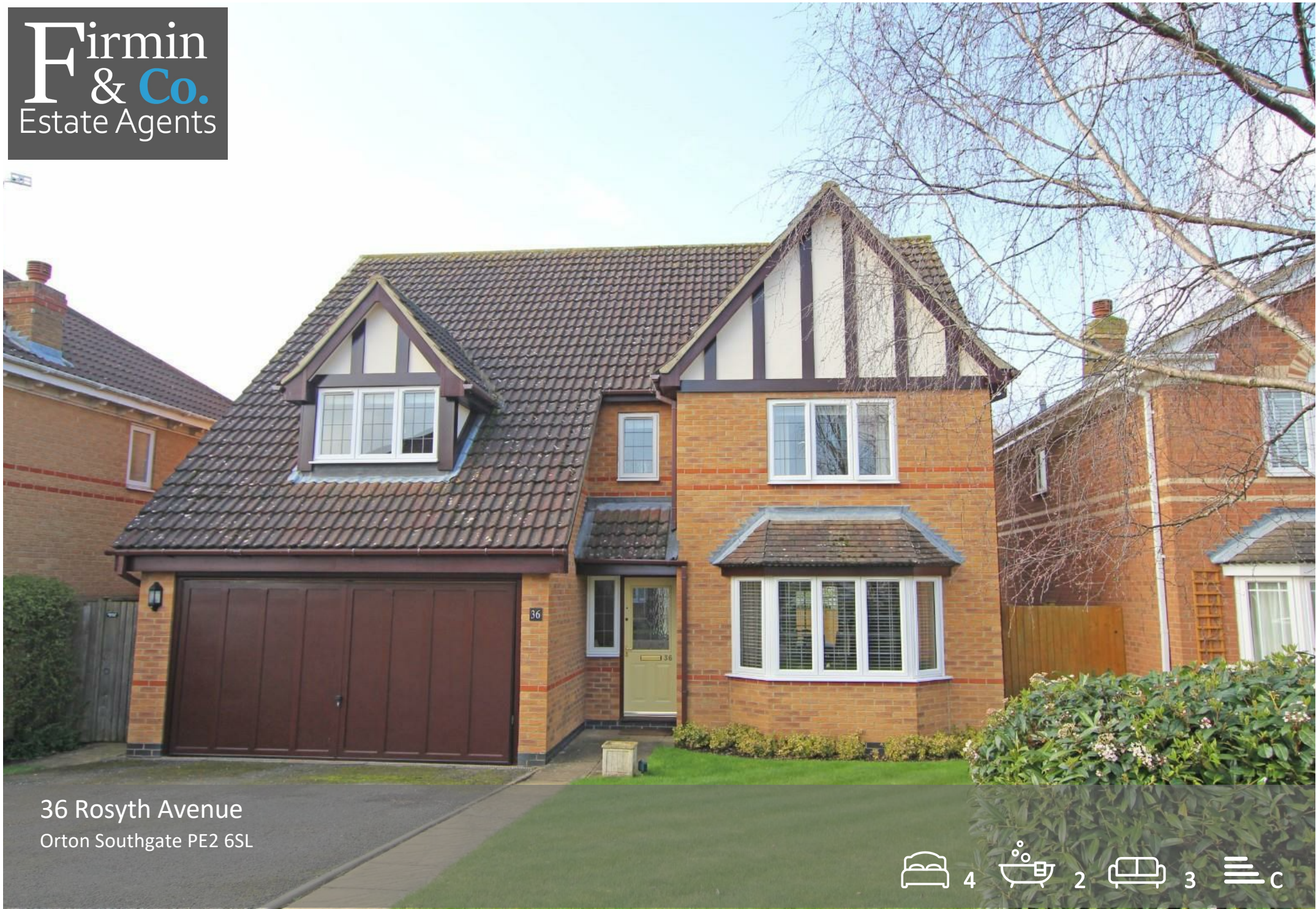
36 Rosyth Avenue Orton Southgate PE2 6SL