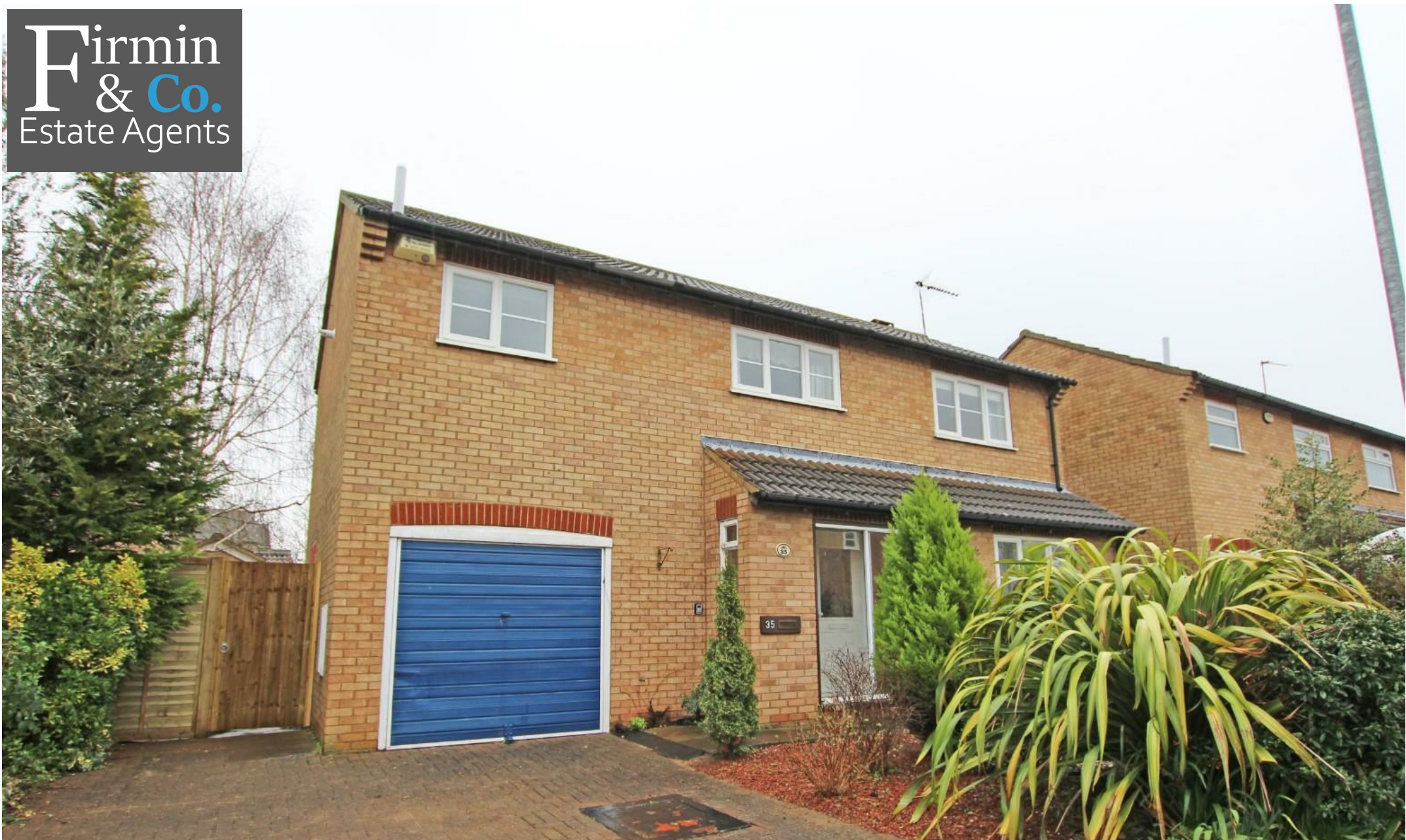
35 Carradale Orton Brimbles PE2 5XQ