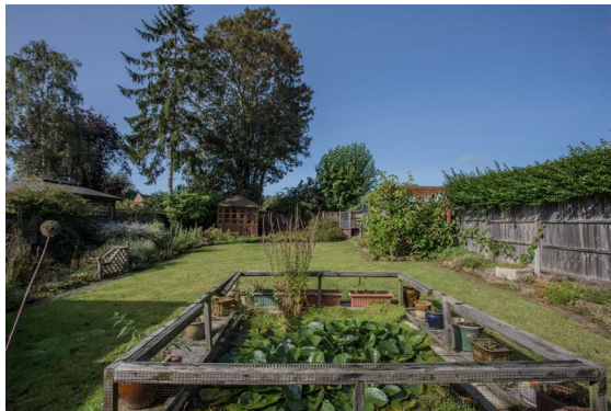
Outside To the front of the property is an open plan garden laid to lawn with a block paved driveway for several vehicles leading to a SINGLE GARAGE. Side access leads to an ENCLOSED GARDEN laid to lawn with a fish pond, summer house and mature shrubs.