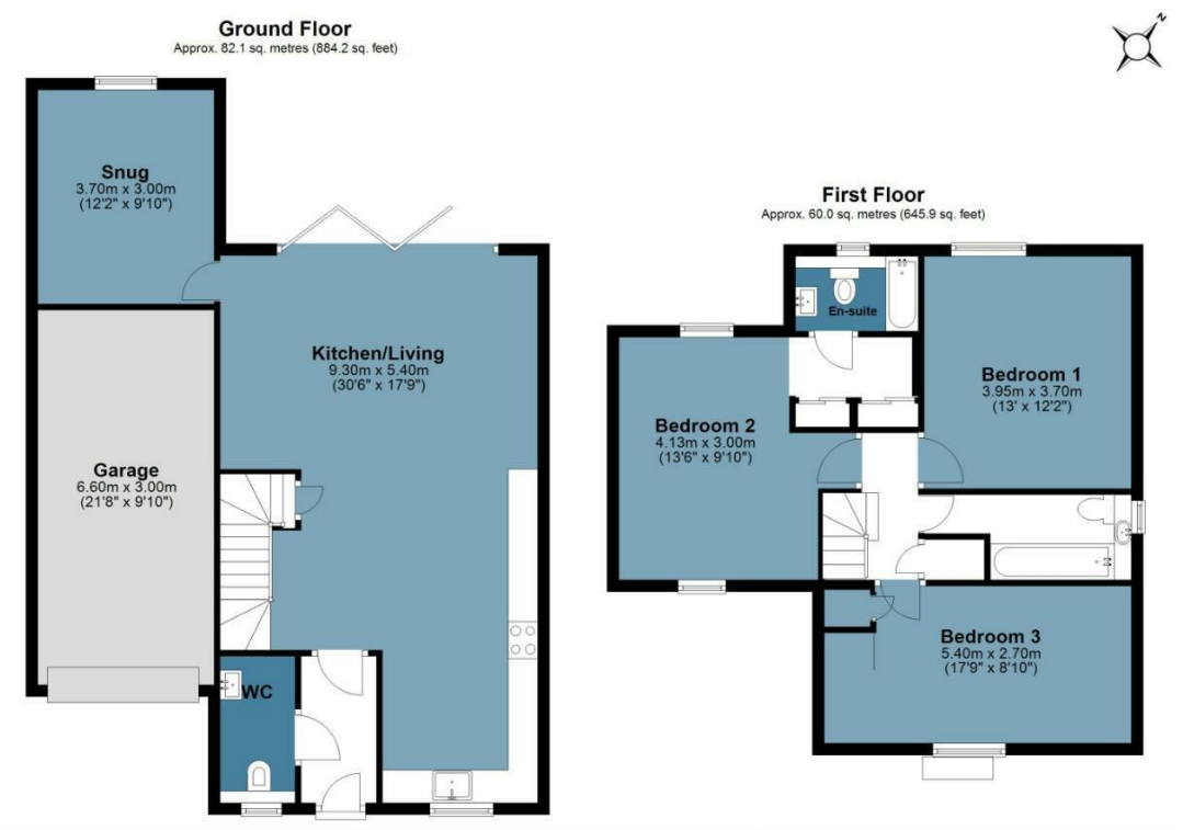
Measurements are approximate and for illustration purposes only. While we do not doubt the accuracy and completeness, we advise you conduct a careful independent assessment of the property to determine monetary value.

IMPORTANT NOTICE - These particulars have been prepared in good faith and they are not intended to constitute part of an offer or contract. We have not performed a structural survey on this property and the services, appliances and specific fittings have not been tested. All photographs, measurements, floor plans and distances referred to are given as a guide and should not be relied upon.