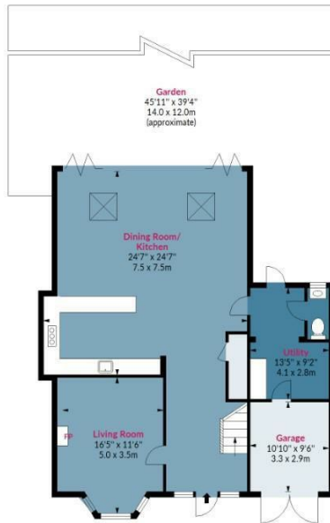
Ground Floor Floor Area 1029 Sq Ft - 95.59 Sq M (Excluding Garage)