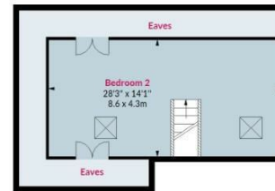
Second Floor Floor Area 398 Sq Ft - 36.97 Sq M

Floor plan is for illustrative purposes only and is not to scale. Every attempt has been made to ensure the accuracy of the floor plan shown, however all measurements, fixtures, fittings and data shown are an approximate interpretation for illustrative purposes only. lpaplus.com