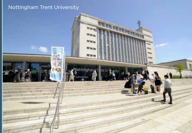
Nottingham Trent University