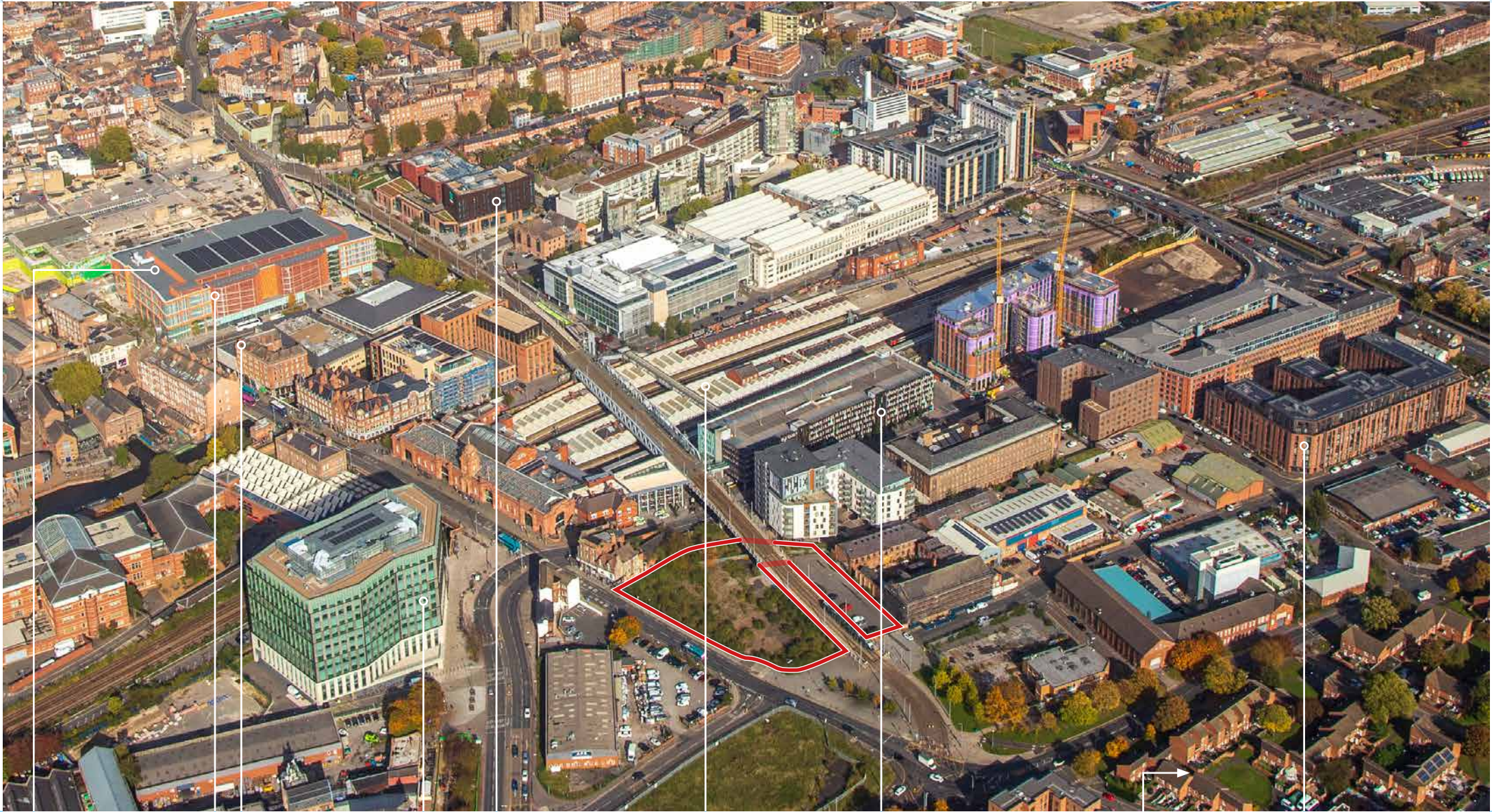
NOTTINGHAM BUS STATION