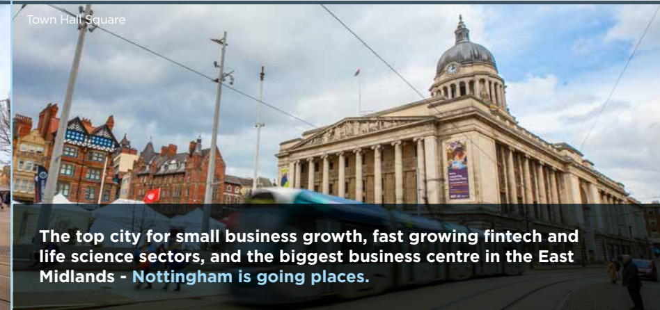
Town Hall Square

The top city for small business growth, fast growing fintech and life science sectors, and the biggest business centre in the East Midlands - Nottingham is going places.