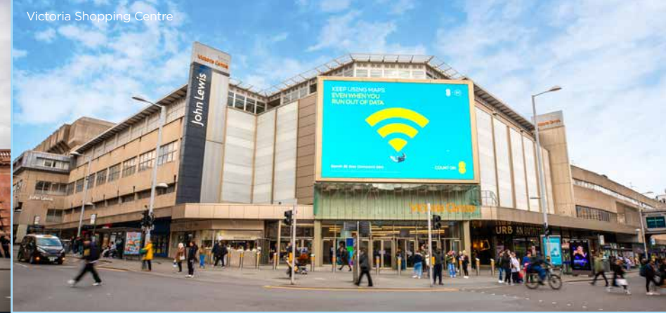
Victoria Shopping Centre