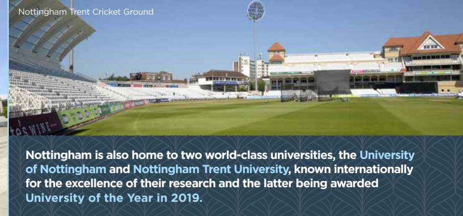
Nottingham Trent Cricket Ground

Nottingham is also home to two world-class universities, the University of Nottingham and Nottingham Trent University, known internationally for the excellence of their research and the latter being awarded University of the Year in 2019.