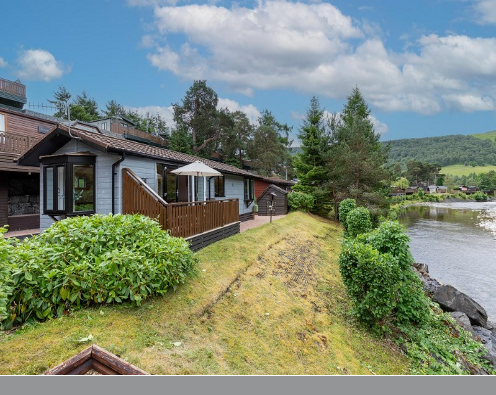
Otter, River Tilt Park, Bridge Of Tilt, Pitlochry, PH18 5TA Offers Over £90,000