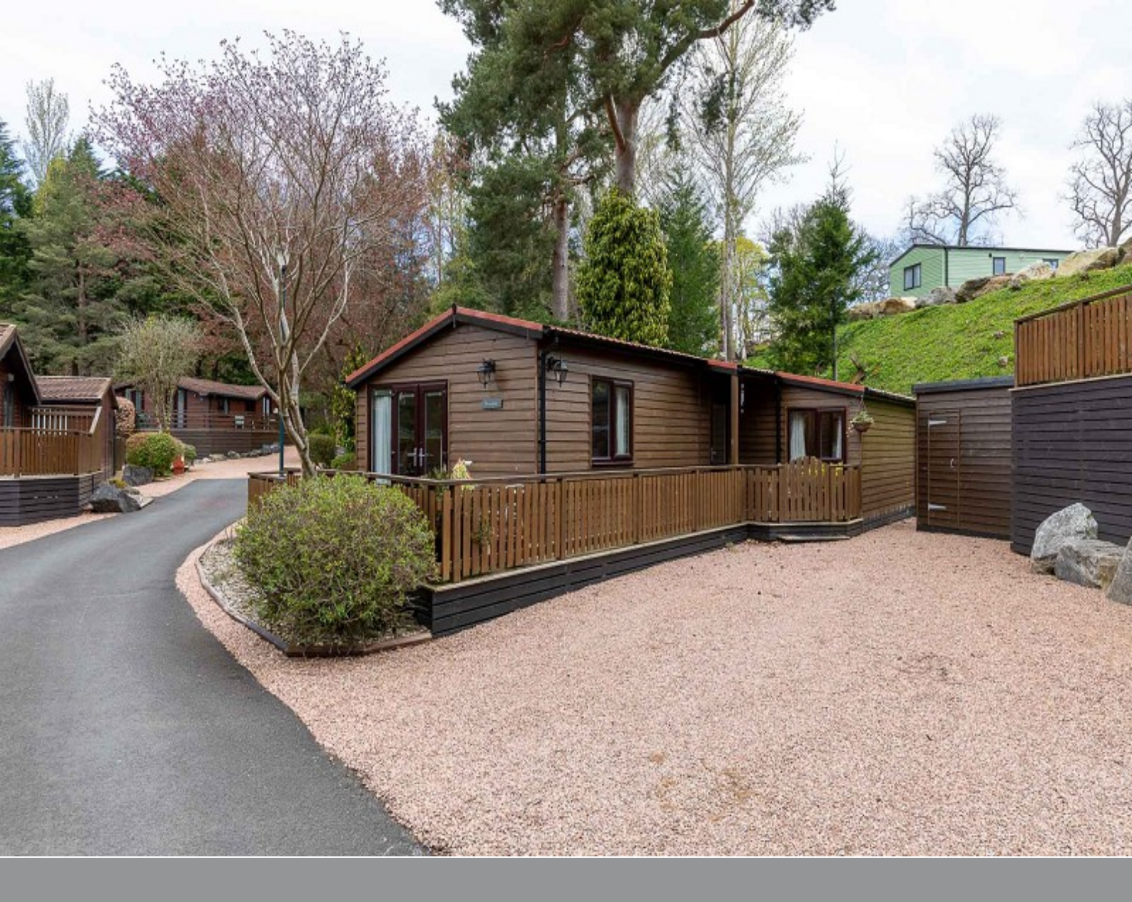
Beinn aGhlo, River Tilt Park, Bridge Of Tilt, Pitlochry, PH18 5TE Fixed Price £85,000