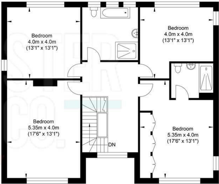
First Floor Approximate Floor Area 1082.95 sq ft (100.61 sq m)

Approximate Gross Internal Area = 201.22 sq m / 2165.91 sq ft Illustration for identification purposes only, measurements are approximate, not to scale.