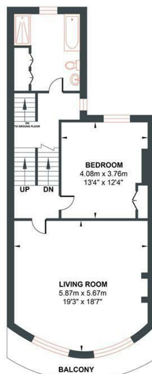
FIRST FLOOR Approximate Floor Area 729.57 sq ft (67.78 sq m)