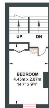
HALF LANDING Approximate Floor Area 220.98 sq ft (20.53 sq m)