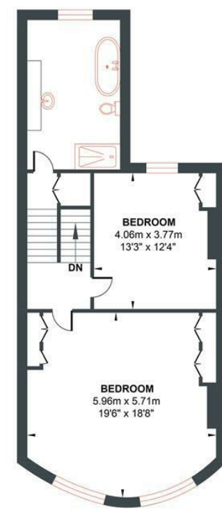
SECOND FLOOR Approximate Floor Area 729.57 sq ft (67.78 sq m)