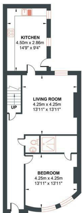
BASEMENT Approximate Floor Area 729.57 sq ft (67.78 sq m)

Approximate Gross Internal Area = 291.65 sq m / 3139.29 sq ft Illustration for identification purposed only, measurements are approximate, not to scale.