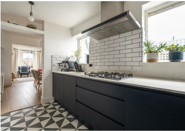
Reception 15'5" x 31'5"