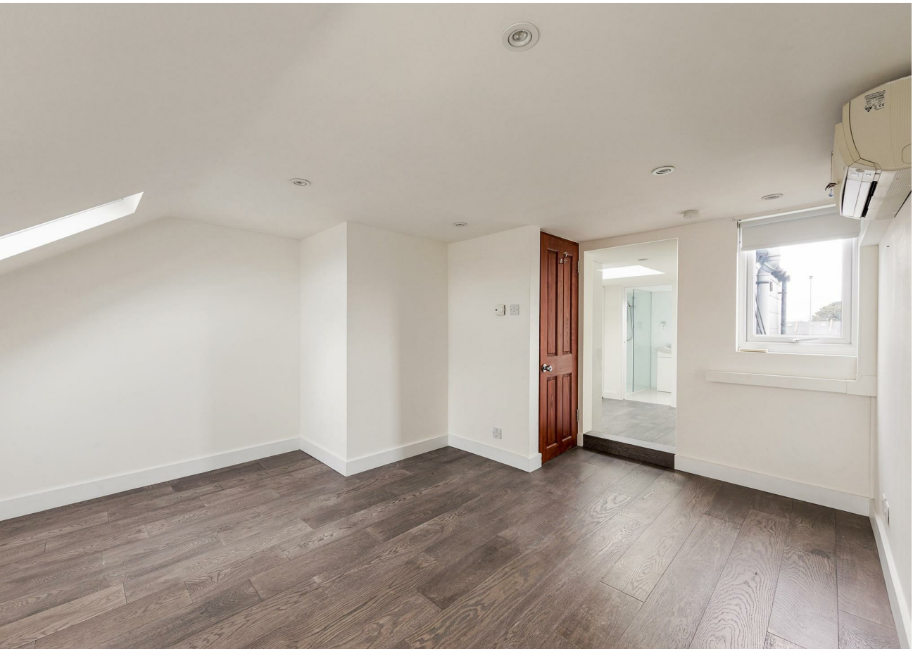
Ensuite 8'5" x 5'2"