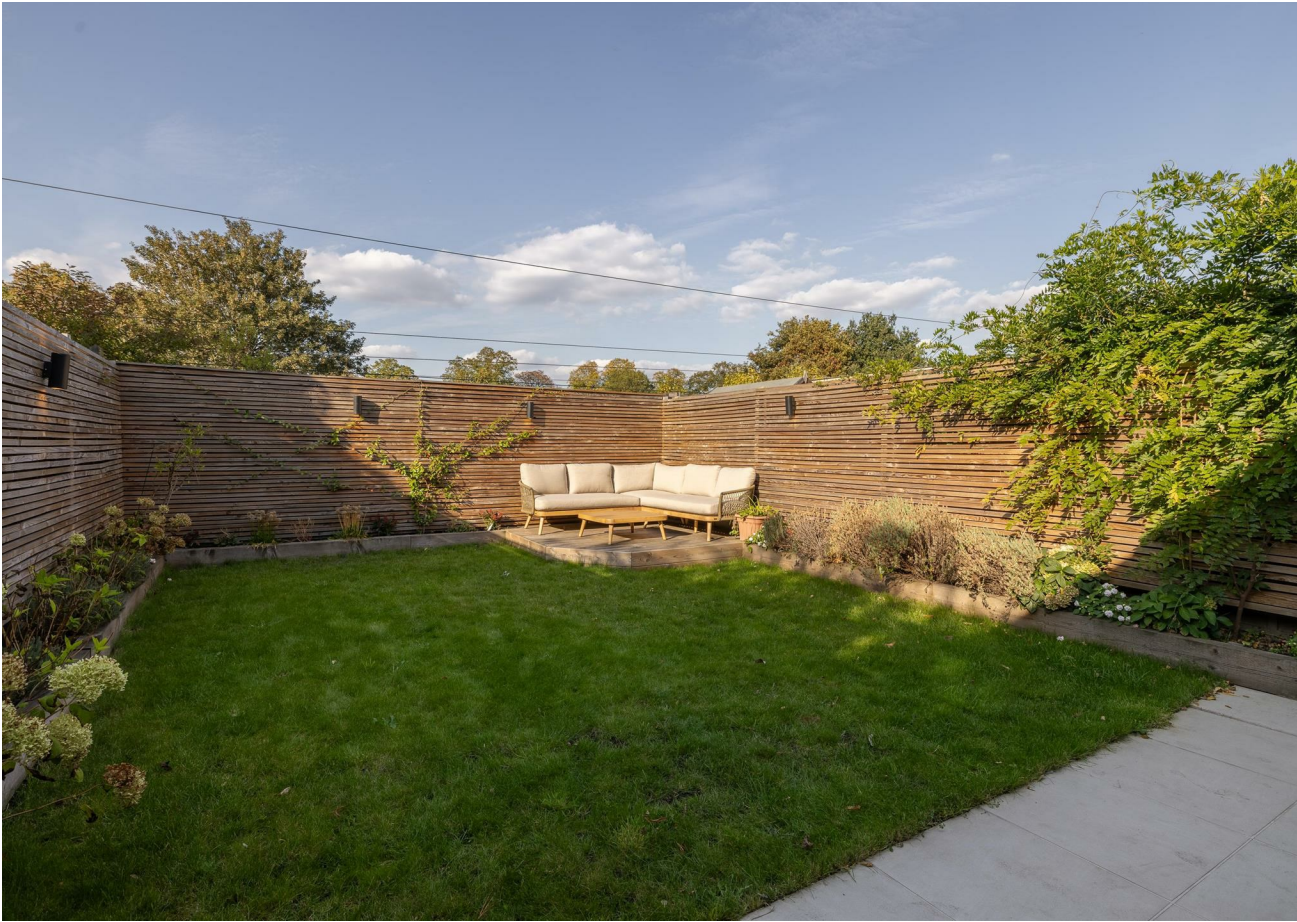
Garden 20'0" x 28'2"