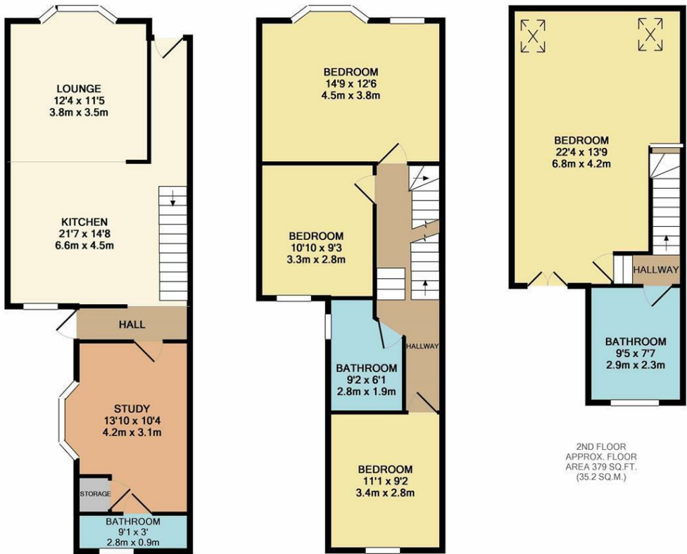
GROUND FLOOR APPROX. FLOOR AREA 522 SQ.FT. (48.5 SQ.M.)