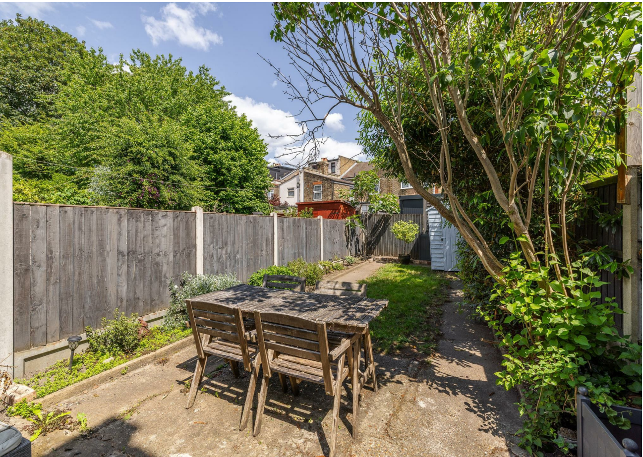
Garden 14'1" x 36'8"