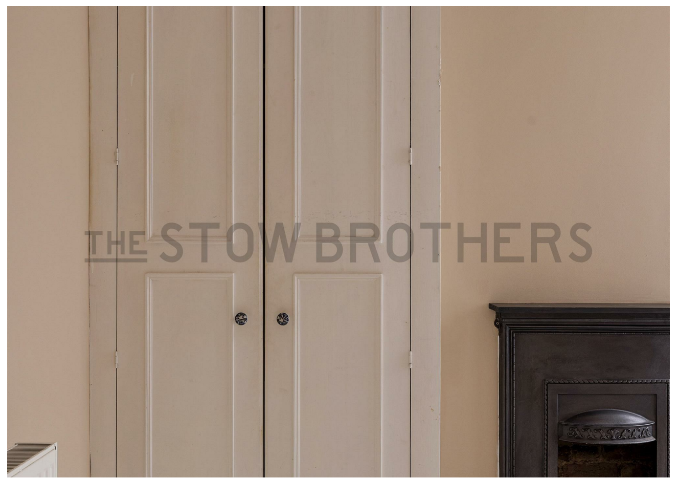
FOLLOW US → @STOWBROTHERS STOWBROTHERS.COM