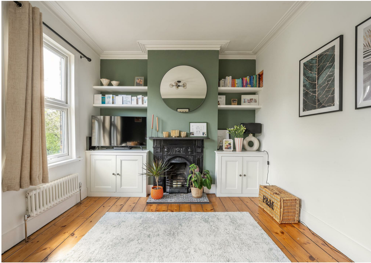
Reception 15'1" x 10'5"