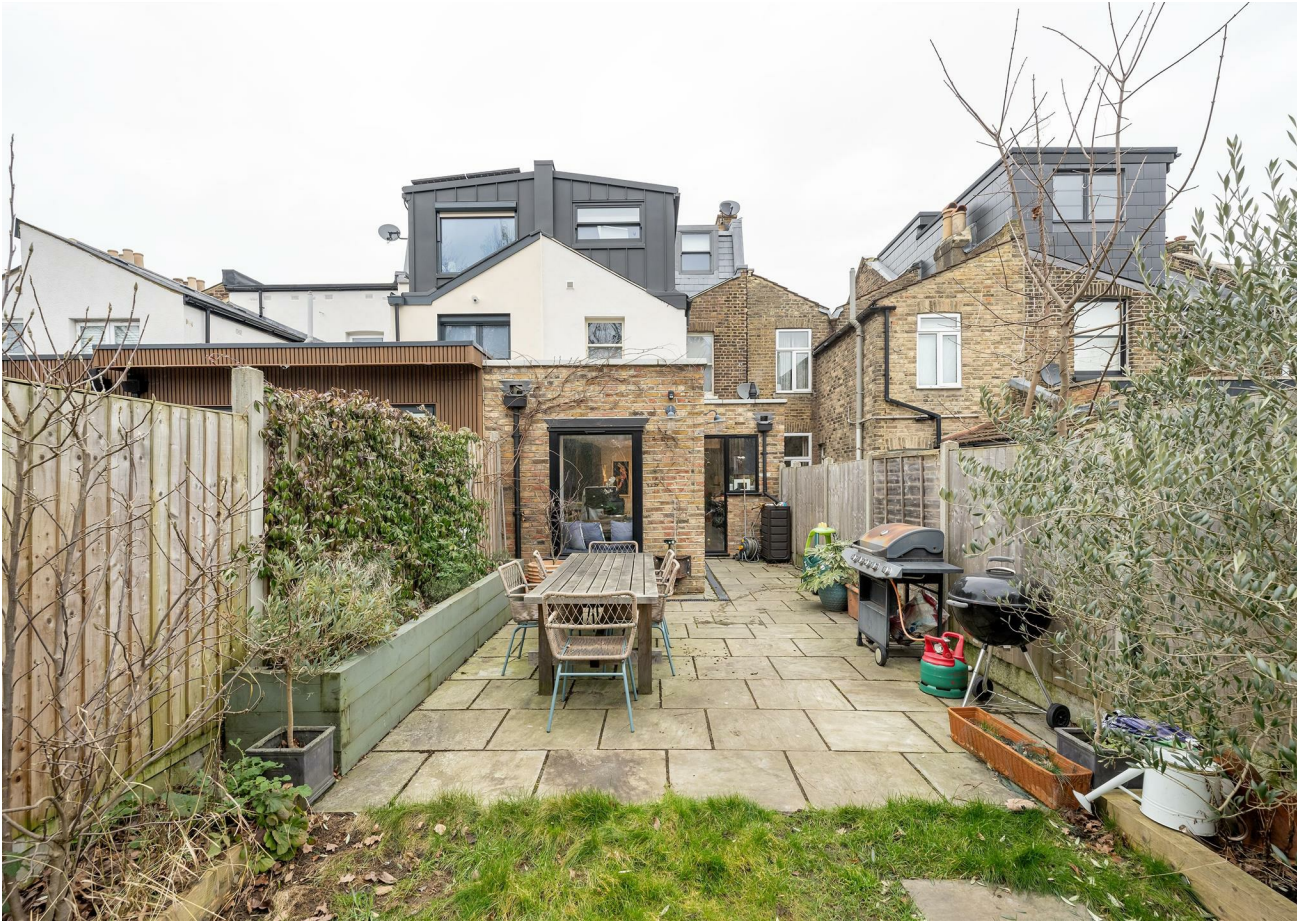
Garden Room 12'8" x 17'6"