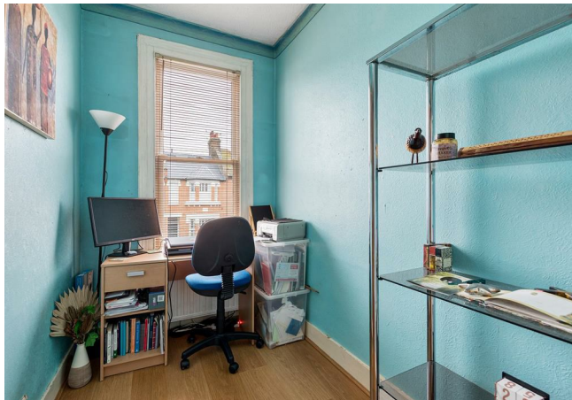
Bedroom 11'6" x 11'4"