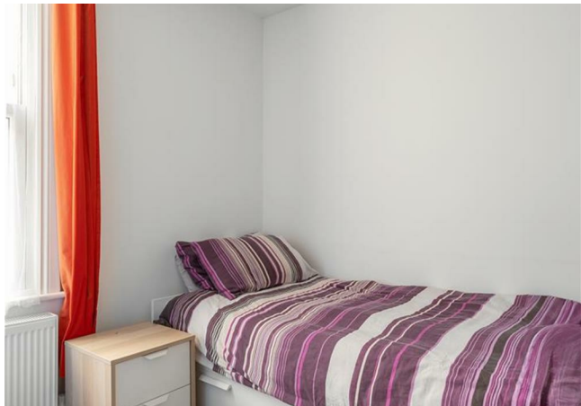
Bedroom 15'10" x 14'3"