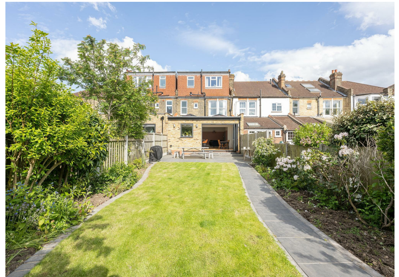
Garden 85'9" x 21'1"