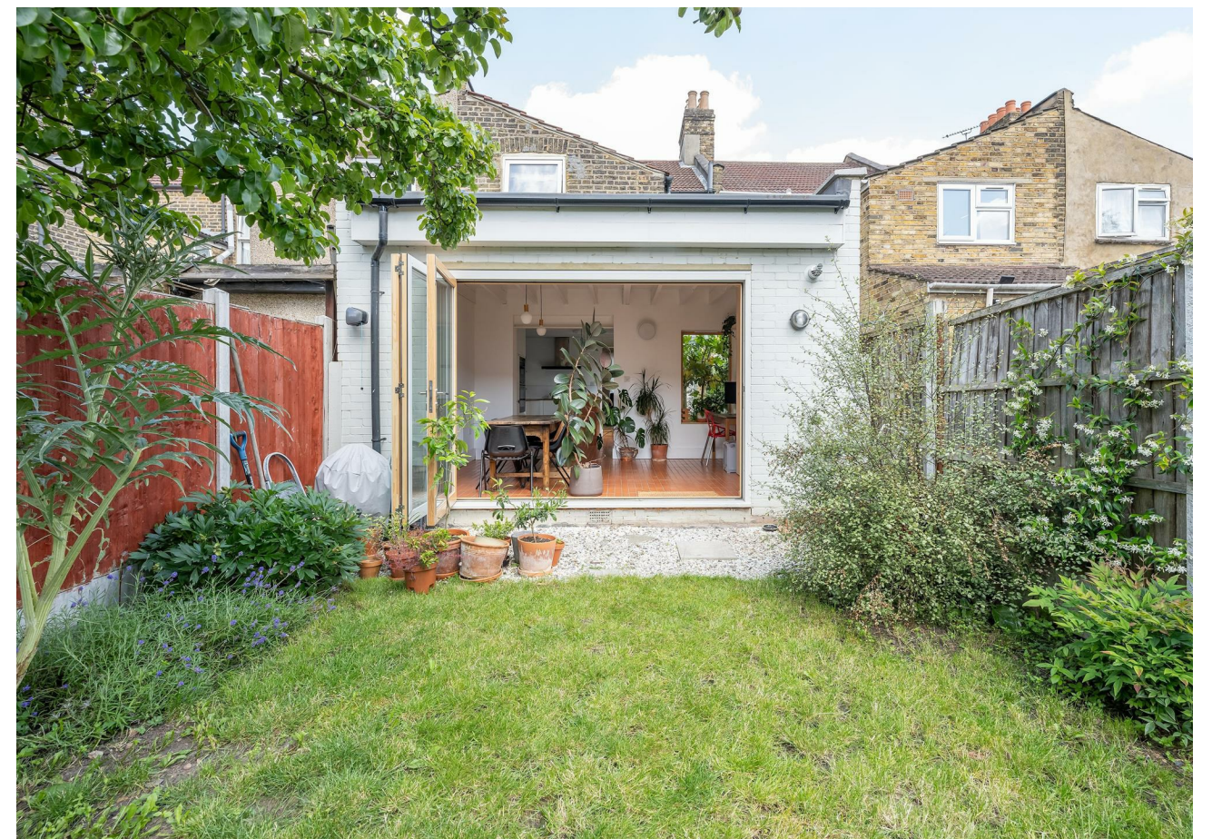
Garden 16'6" x 29'0"