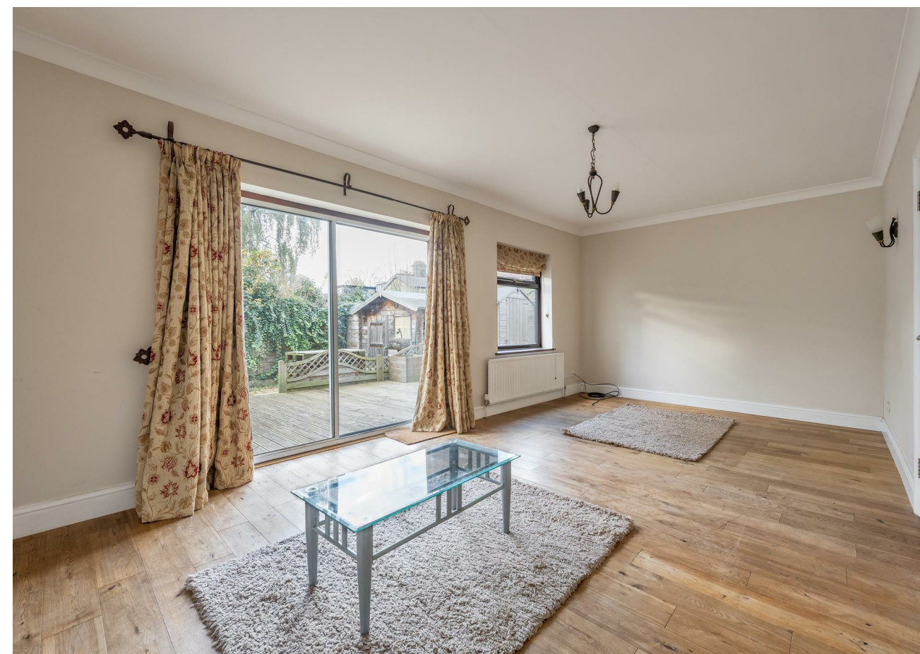
Bedroom 4 9'9" x 10'11"