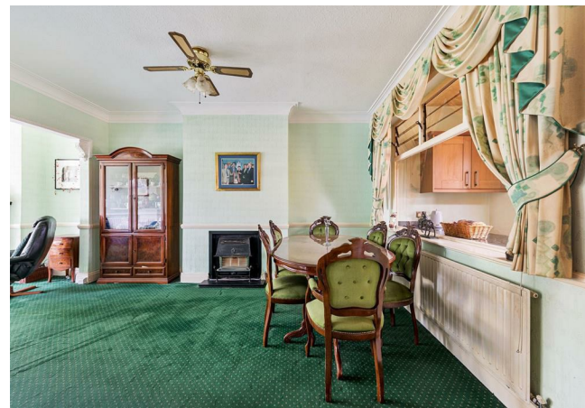
Reception Room 31'3" x 20'0"