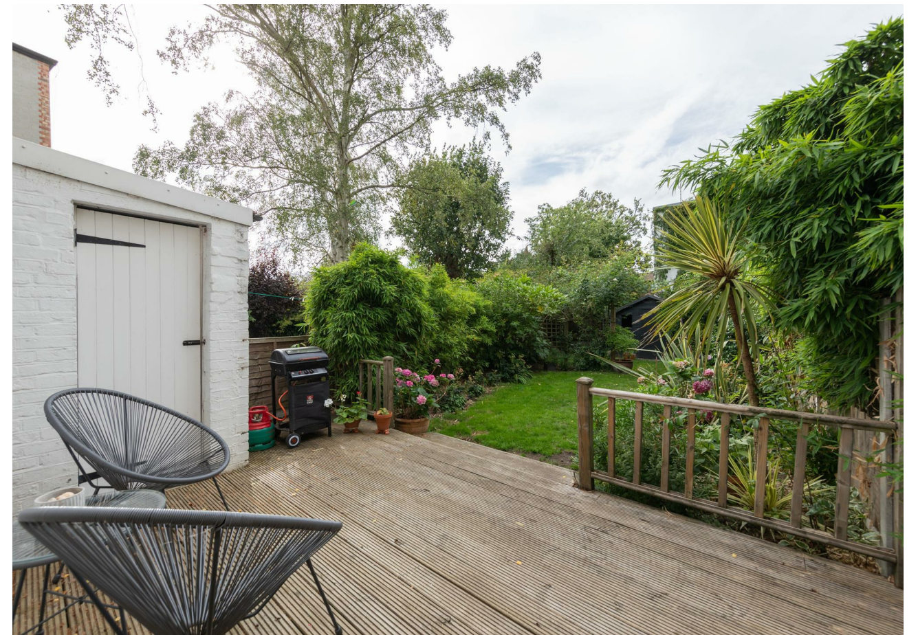
Garden approx. 55'9"