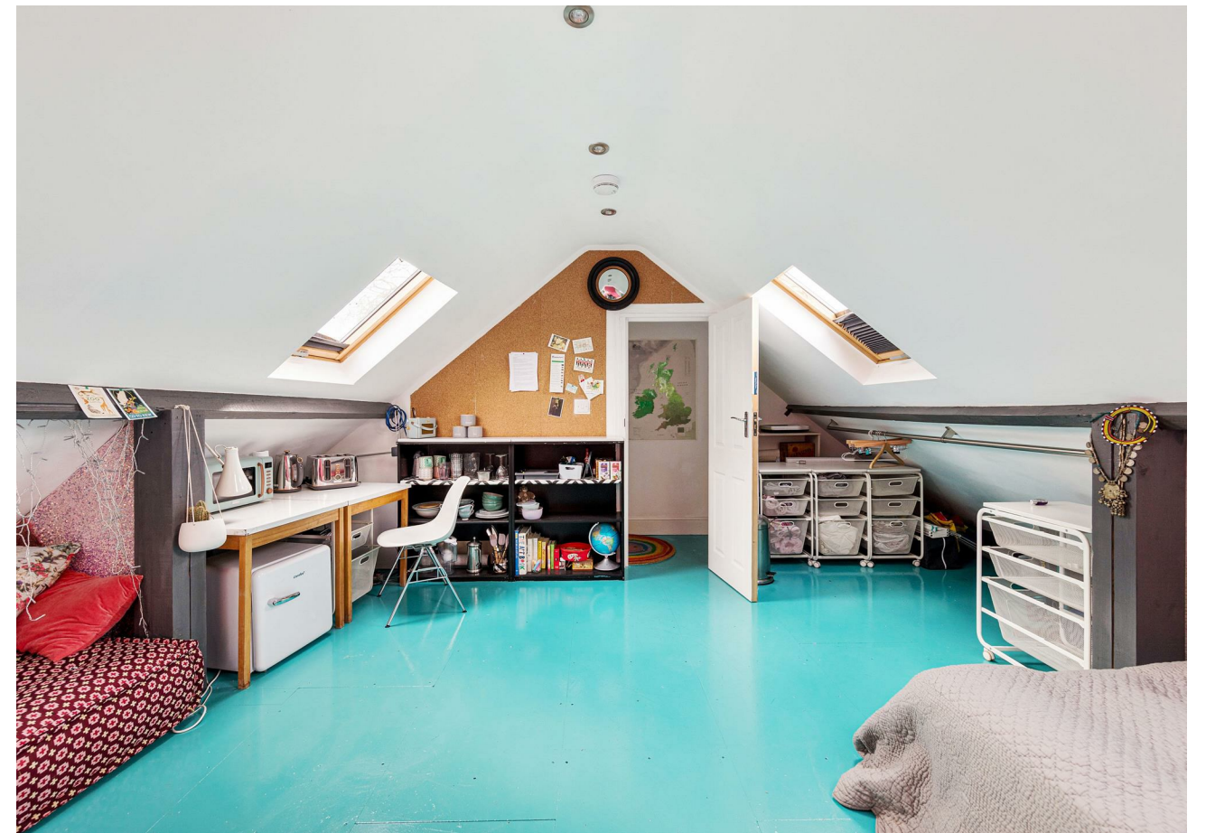
Bedroom 14'6" x 13'0"