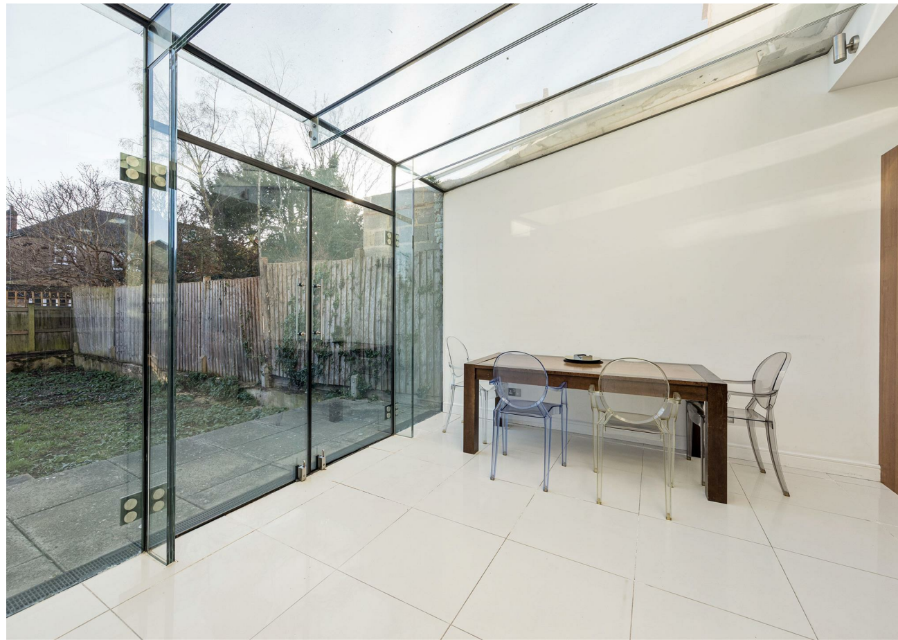
Reception 15'9" x 11'8"