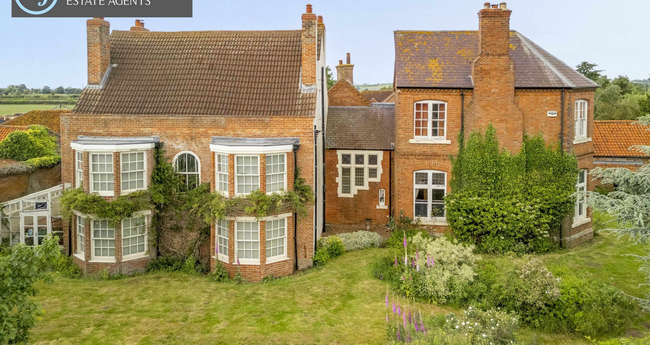
The Old House Crab Lane North Muskham, NG23 6HH Guide Price £750,000