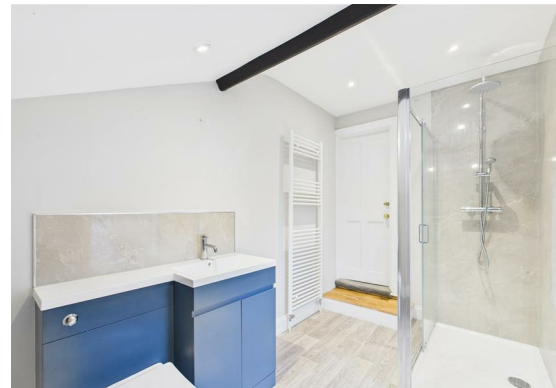
Outside WC 3'1" x 6'1" (0.96 x 1.86)