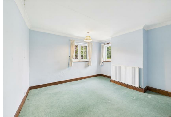
Sun Room 12'6 x 7'7 (3.81m x 2.31m)