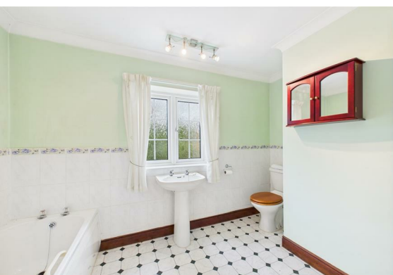
Bathroom 8'10 x 8'3 (2.69m x 2.51m)