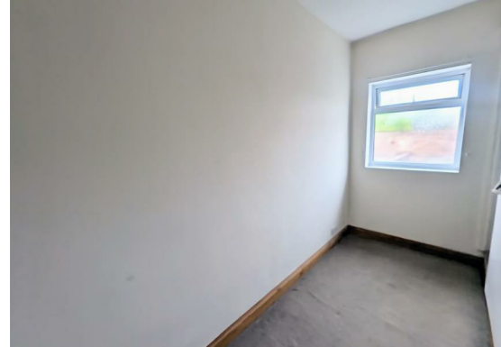
Kitchen 11'2 x 10'1 (3.40m x 3.07m)