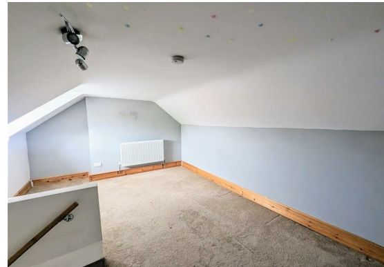
Attic Room 18'1 x 11'2 (5.51m x 3.40m)