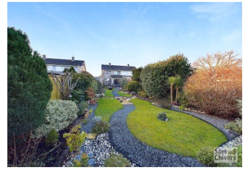
'An immaculate and extended semi detached home that has been tastefully modernised and transformed by the current owner and also enjoys a lengthy, sunny garden that has been beautifully landscaped.'

This beautiful, extended three bedroom semi detached home, situated on the entrance to the desirable Charlton Park development is one to be viewed to be fully appreciated. The property has an entrance hallway with stairs to the first floor and a door into a lovely lounge at the front of the property. The kitchen dining room has been extended to create an attractive L-shaped kitchen/dining room with modern units and work surfaces and overlooks the rear garden. Also on the ground floor there is a further extension to the side which creates a smart ground floor shower room. On the first floor there are three very god sized bedrooms and also a main family bathroom. The property has GCH and double glazing and has a tasteful and contemporary theme running throughout the property.