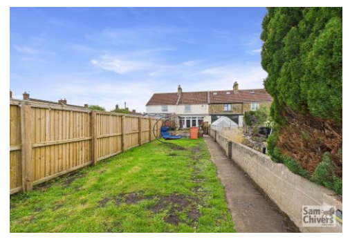
'A two bedroom terrace cottage centrally located within the village of Peasedown St. John, an ideal commuter base for those needing access to Bath!'

A two bedroom mid terrace cottage offering generous sized accommodation coupled with a lengthy garden. The property has an entrance lobby which is also used as a utility area and leads through to a nice size dining room with access to the kitchen. The lounge is located at the rear of the property, has been extended and has been tastefully finished with a log burner, storage and there are doors out to the garden. On the first floor there are two comfortable double bedrooms and a family bathroom. GCH and double glazing.