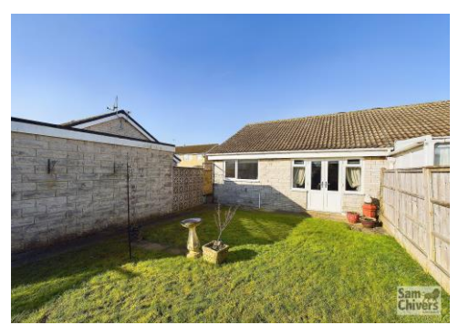
'A smart, well presented two bedroom semi detached bungalow within the ever popular Janes estate and is offered for sale with no onward chain!'

A two bedroom semi detached bungalow offering well proportioned accommodation and that has been well maintained by the current owner. The accommodation comprises entrance hallway with doors leading to all other accommodation, lounge with French doors opening onto the garden, a well fitted kitchen room, two double bedrooms and there is a wet room. The property is double glazed and has gas central heating. Offered for sale with no onward chain.