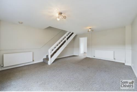
'A good size three bedroom terraced home on the ever popular Waterford Park development and is offered for sale with no onward chain!'

This three bedroom terraced home occupies a nice position on the development and has well proportioned accommodation comprising; entrance porch leading into a spacious lounge/dining room and stairs to the first floor. There is kitchen/dining room across the rear and has a door leading into the garden. On the first floor there are three bedrooms all of which are a comfortable size and a pleasant family bathroom which has a bath with shower over, hand basin and wc. GCH and double glazing. Offered for sale with no onward chain.