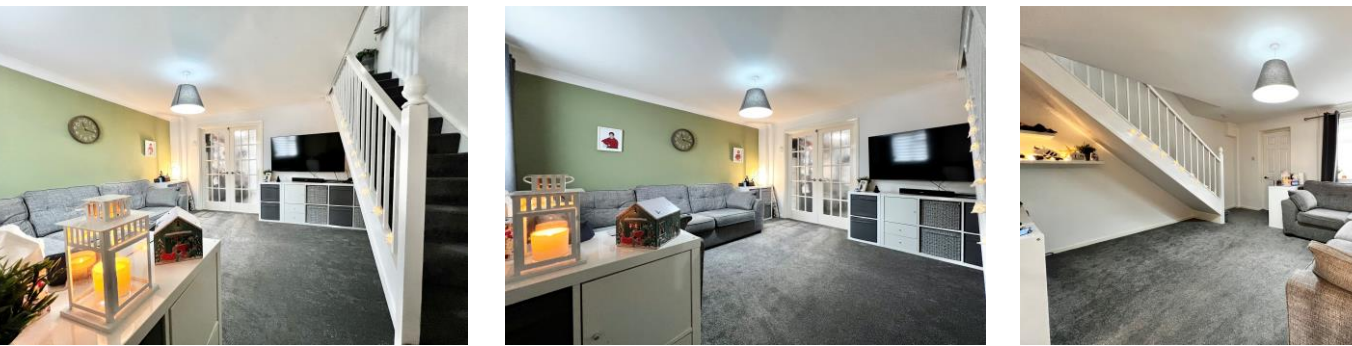
'An extended three bedroom semi detached home within walking distance of the town centre and public transport connections making this an ideal spot for those looking to commute to Bath!'

This three bedroom semi detached home has been extended to create generous sized living accommodation on the ground floor. The property has an entrance porch which leads into a nice size lounge with stairs to the first floor ad beyond the lounge is an extended kitchen/dining room with sliding doors opening to the ground floor. There is also a handy conservatory which is currently set up a a games room. On the first floor thee are three bedrooms as well as a family bathroom. GCH and double glazing.