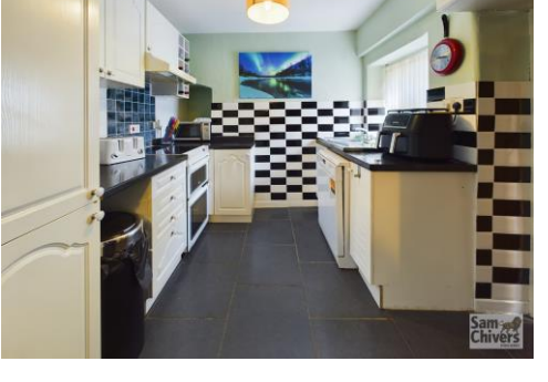
'A charming natural stone cottage set in a quiet position and enjoys a good size kitchen/dining room!'

This charming two bedroom terraced cottage is in tidy order and would make the ideal first home. There is a cosy lounge which overlooks the sunny garden and has the stairs to the first floor and there is a well fitted kitchen/dining room which is a really generous size. There is a rear lobby area with door into the bathroom with shower over bath. On the first floor there are two generous sized bedrooms with storage and the property also benefits from upvc double glazing and gas central heating.