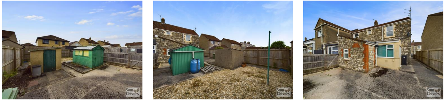
'If you're looking for a sizeable property that requires modernisation and is perfect to get stuck into then this could be just what you are looking for!'

This three bedroom end of terrace home is in need to some updating internally but offers good size accommodation and also has plenty of easy parking to the front. Upon entering the property there is an entrance lobby which leads through to the hallway with stairs to the first floor. There is a lounge/dining room which could easily be opened up to create one very generous size room. The kitchen area requires reconfiguration from its current layout and there is a ground floor bathroom. On the first floor there are three bedrooms. The property has electric heating and double glazing. Offered for sale with no onward chain.