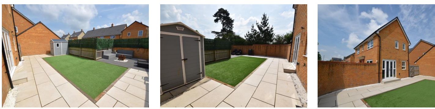
'Its all about the modern way of living with a super kitchen/dining room with doors opening out onto a generous sized garden which has been landscaped for ease of maintenance and is perfect for entertaining!'

This three bedroom detached home comes to the market and is presented almost as new having been very well cared for and cosmetically updated by the current owners over the period of their ownership. As you step through the front door there is a good size entrance hallway with doors to both lounge and kitchen/dining room, stairs to the first floor, a handy wc and store cupboard. The lounge has a dual aspect and a large feature media wall and the kitchen/dining room offers a range of modern high gloss wall and floor units, integrated appliances and a breakfast bar/island. On the first floor there are three bedrooms, the main bedroom is a very good size with en suite shower room, bedroom two is also a comfortable double and bedroom three is a single or as currently se up an office/dressing room. The main family bathroom is also in very good condition. GCH and double glazing. The property is sold with the remainder of its NHBC build warranty.