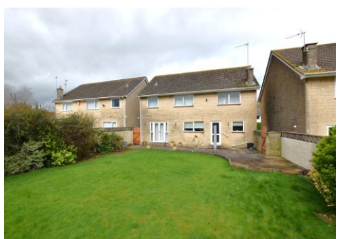
'An opportunity to purchase an exceptionally large, established family home which has had only one owner from new and has no onward sales chain!'

This mature, four bedroom detached family home is one not to be missed having been under the same ownership from its build in the early 1970's and offers a huge amount of spacious living accommodation coupled with a large level garden. Upon entering the property there is a large L-shaped hallway with stairs to the fist floor and doors to all ground floor accommodation. There is a good size lounge with a picture window to the front, separate dining rom (formally one half of the double garage), second reception room/snug and a kitchen breakfast room plus a utility. Also on the ground floor is a separate wc. On the first floor there are four exceptionally large bedrooms including the main bedroom which has both an en suite bathroom and a walk-in wardrobe and the three remaining doubles all have built in wardrobes, plus there is a generous size family bathroom with bath and shower enclosure and separate wc. The property has gas central heating and is double glazed.