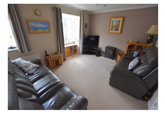
'This side of town works great for us as a family as the schools are still within walking distance and we have easy access onto the Greenway/cycle path for those leisurely Sunday strolls.'

An attractive four bedroom detached family home that is presented in lovely order having had just one owner from new and is set within a well regarded development on the fringe of the town, perfectly suiting a growing family given its fantastic location! On entering the property there is an entrance hallway with stairs to the first floor, under stairs storage and a ground floor wc. There is a bay fronted lounge that is a good size and the kitchen/dining room stretches the across the rear of the property, has access out to the back garden and houses the modern gas boiler replaced within the past 12 months. On the first floor there are four well proportioned bedrooms plus a shower room. GCH and double glazing.