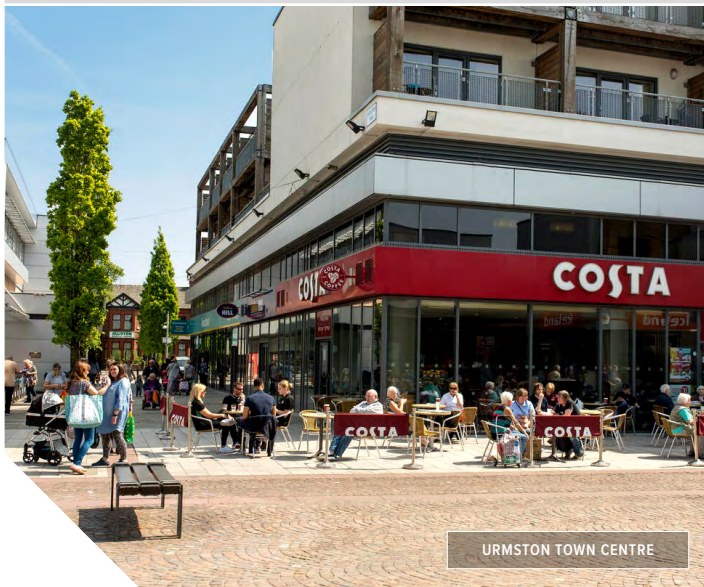
URMSTON TOWN CENTRE

The site is open to see from the public highway, however onsite inspection is strictly by appointment with the sole selling agent Colliers.