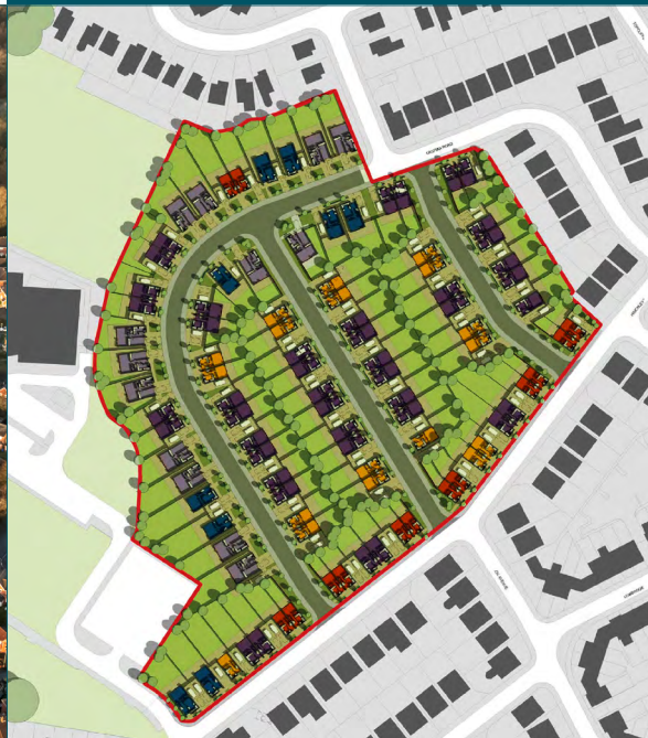
INDICATIVE DESIGN PLAN

A full Information Pack is available for inspection and download within a dedicated electronic data room.