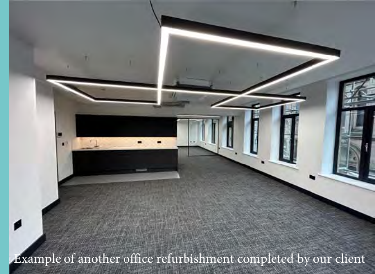
Example of another office refurbishment completed by our client