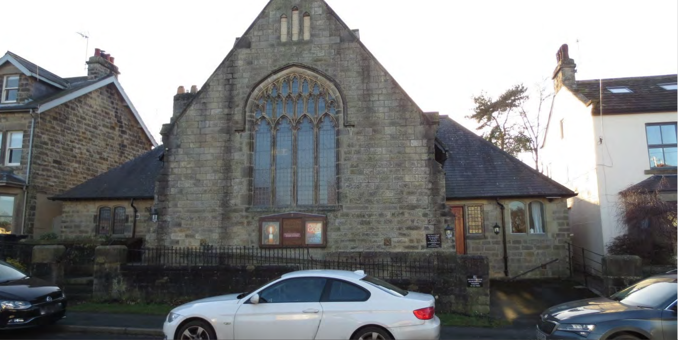
Hampsthwaite Methodist Church, Hollins Lane, Harrogate HG3 2EJ