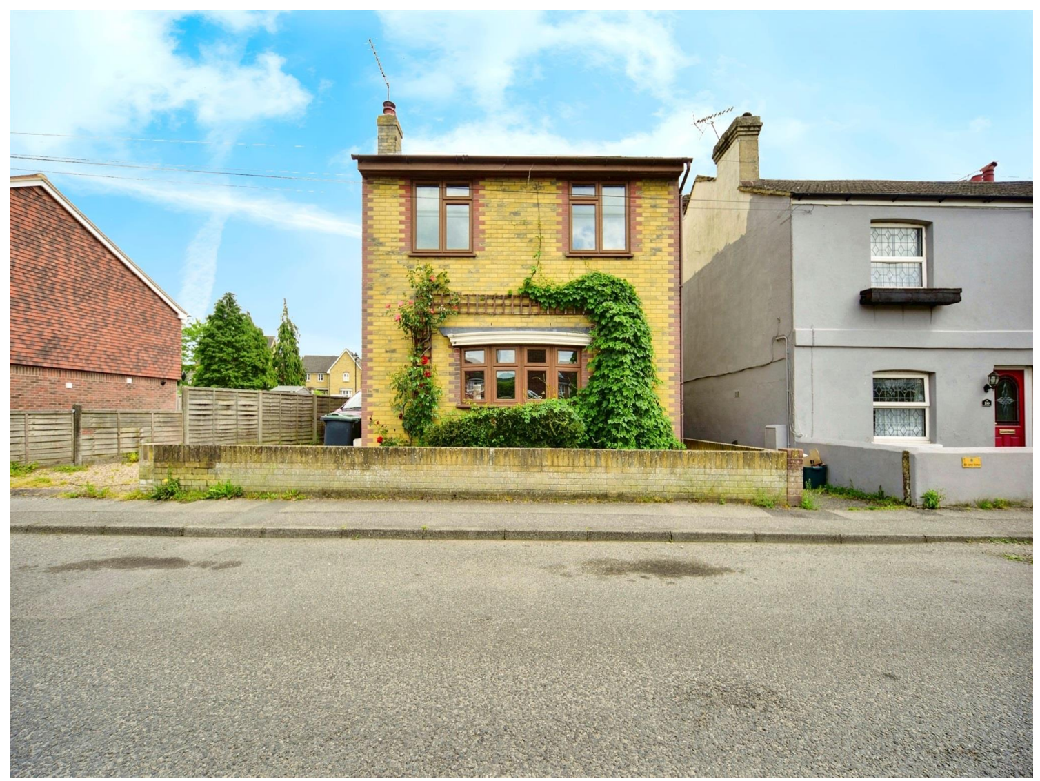
High Street Wouldham Rochester ME1 3UW

This property in Wouldham village features four bedrooms, parking, a garden, a spacious kitchen, conservatory, and a WC. The setting near the river Medway adds to the appeal of this charming home.