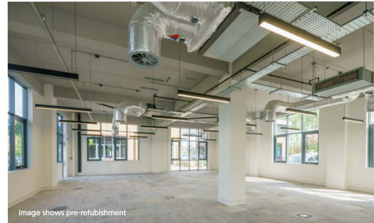
Image shows pre-refurbishment