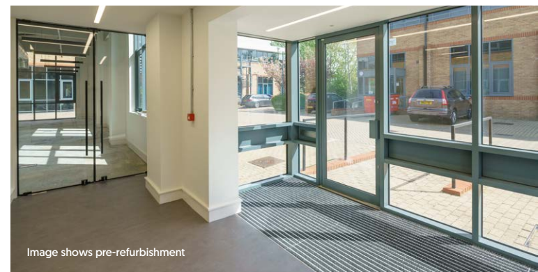
Image shows pre-refurbishment