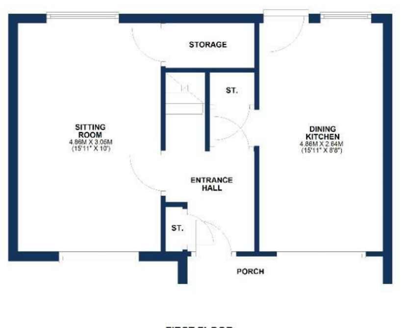
FIRST FLOOR APPROX 378 SQ METRES (406 9 SQ FEET)

GROUND FLOOR APPROX 39.8 SQ. METRES (428.8 SQ. FEET)